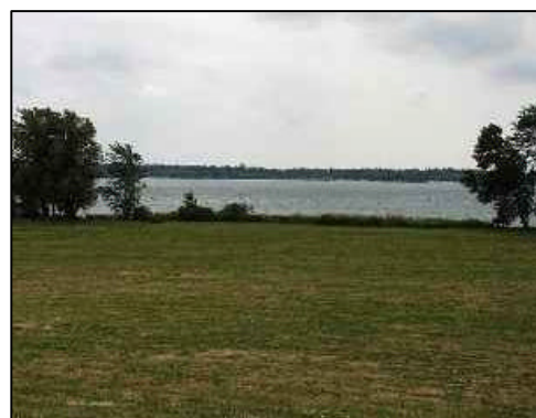
Beaver Run – LOG Concours Site

Of course, August 15 – 17 is the Lotus Owners Gathering in Grand Island, NY. Expect the official announcement to come in the next issue of the Lotus ReMarque . But if you can't wait an entry form is available on www.LotusCarClub.org , the Lotus Limited site. See you there!