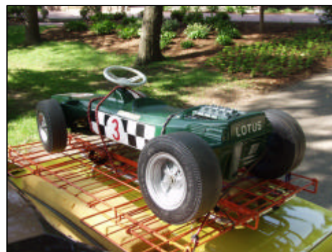
Look what came in on the back of a TR6 last year!

This is the last call for a gathering on the lawn at the Hermitage House and Museum. We already have enough Lotus cars entered to award trophies to the First, Second, and Third in a special Lotus class. Even if you don't consider your car to be show quality, come on out and enter anyway, it's a fun day...you might win the award for Diamond in the Rough! Bring a picnic basket, take the tour of the mansion house. You and your passenger(s) get in for the price of a single entry. We have lots of door prizes too, something for everyone.