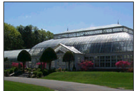
Duke Farms' Indoor Display Gardens

The second leg of the Drive will meander north, finishing up at the Duke Farms in Hillsborough. Once the estate of tobacco heiress Doris Duke, there are several tours available (see